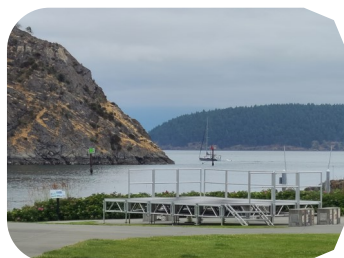
The view from our meeting facility.