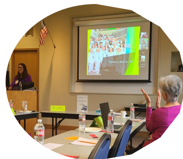
Enjoying the presentation from the National Federation.

Stay tuned to hear results and decisions from the Board meeting.