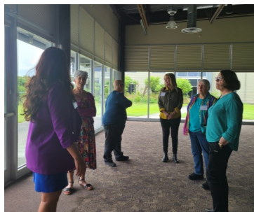
Discussing future possibilities of the meeting facility.